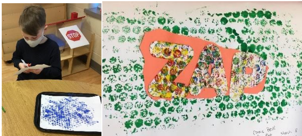
Figure 5 - Fred (5 years), cutting out letters for his Pop Art