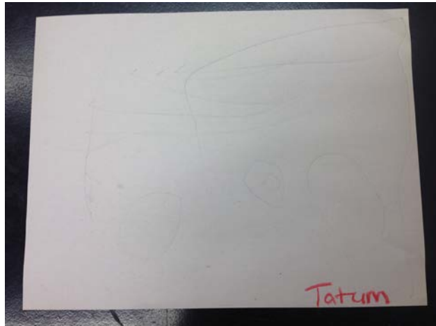
Figure 12: In Tatum's (3.6 years) second drawing after the visit with the backhoe you can see how she incorporated more details in her drawing by adding the wheels and rims