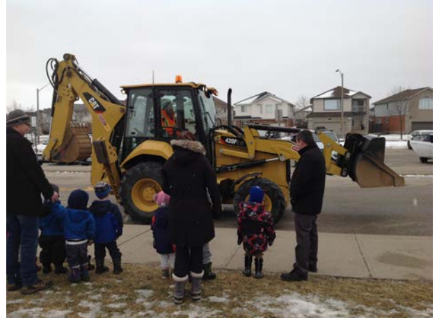
Figure 11: the children looking at our special visitor