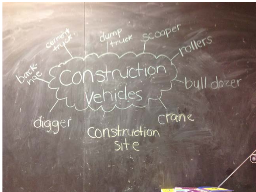
Figure 1: The preschoolers created a topical web based on their interest in construction vehicles.

This project started with the children discussing the three little pigs. One day Dylan, Luka and Nathan were sitting outside with Steph and they began to tell the story of the three little pigs. This began a discussion about construction and the vehicles that are used for building houses. As we moved into the beginning stages of our project, we thought that the children were interested in structures, but as we dug deeper and asked the children what they knew about structures it became apparent that they children were interested in construction vehicles.