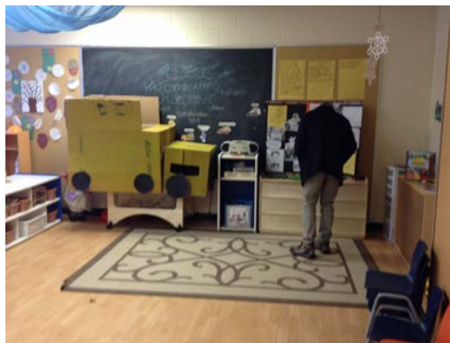
Figure 18: Rory's dad looking at our project research

We knew the project was coming to an end when children started to show more of an interest in talking and learning about the ocean instead of construction vehicles. The children and educators learned a great deal about construction vehicles and how they work and what each vehicles jobs were. We held an open house for our parents to showcase all of our hard work. It was amazing to see how proud the children were to lead their families around the classroom to show off all their hard work. The children were eager to teach their families all about our findings!