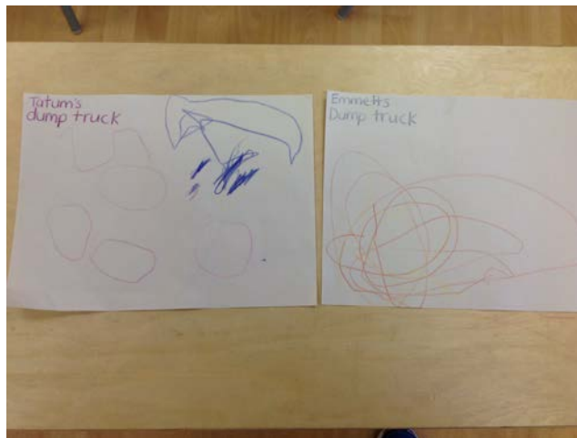
Figure 4: Tatum (3.6 years) and Emmett (2.5 years) first drawing.

Using the Dump truck and Excavator on the table, the children were able to create their first drawings. They were able to use many colours, as well as being able to pick up and explore the vehicles as they drew. Ivy picked up the excavator and traced the shape on her paper.